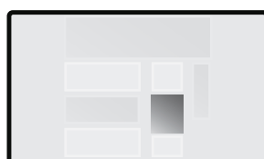
Small rectangle 405 x 360 px