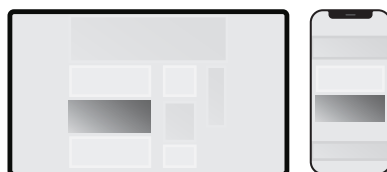
News feed 985 x 380 px