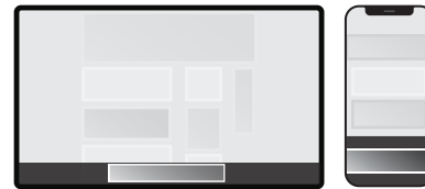
Leaderboard / Mobile Leaderboard 1280 x 200 / 320 x 50