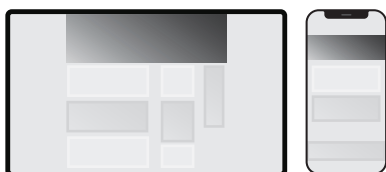
Panorama 1920 x 580 px