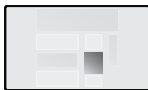
Small rectangle 405 x 360 px